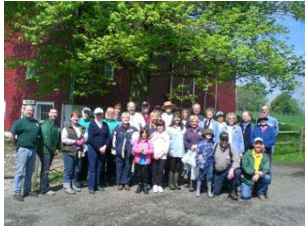
Trail Day Volunteers

Please take the time to apply for a permit to ride at Knox Farm – it's free and takes only a few minutes (get the application by following the link on our website) - www.wcnyshc.org Let's make sure that New York State knows there are horses out there ready to ride in our parks!