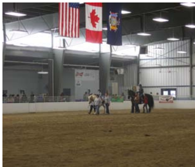
High Hurdles Riders & Volunteers at Equifest 2011

The Western Chapter of the New York State Horse Council is pleased to announce that in lieu of our past practice of awarding scholarships to individual riders, a contribution will be made to each of the 4 local therapeutic riding programs who are Western Chapter members. Creative Partners in Therapy in Youngstown, High Hurdles of SASI in Sardinia, Lothlorien Therapeutic Riding Center in East Aurora, and Equistar in Newfane will each receive $200 to be used for scholarship grants or to be used at their discretion to improve their riding programs.