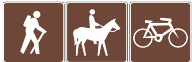
Miscellaneous Signs for kiosk and trailheads